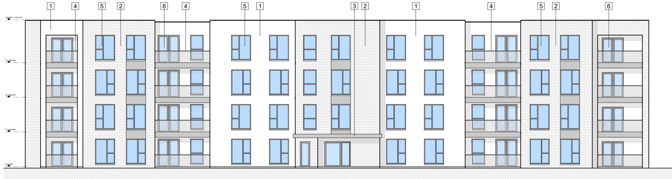
NORTHERN ELEVATION scale 1:200 @ A3

DO NOT SCALE. WORK TO FIGURED DIMENSIONS ONLY. ALL EXISTING DIMENSIONS TO BE CHECKED ON SITE. DRAWN ON AUTOCAD R2004 AT DEADY GAHAN ARCHITECTS LTD LAYERS ON THIS DRAWING COMPLY WITH BS 1192: PART 5