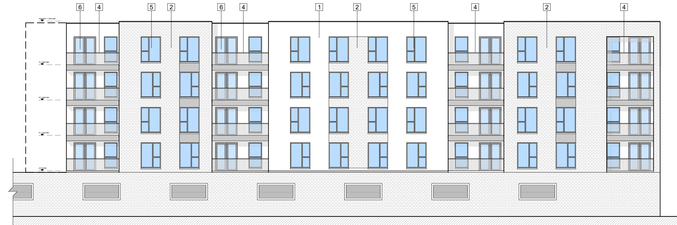
SOUTHERN ELEVATION scale 1:200 @ A3